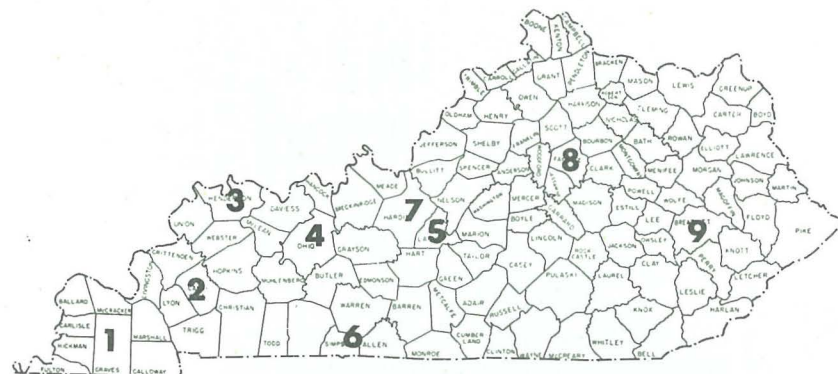
(Locations identified in Table 2.)